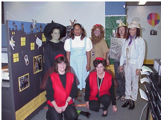
Staff from the Criminal Financial Obligations Unit were totally Oz-some last year as Wizard of Oz characters.

Further details about each contest and the times for each office areas contest will be announced to employees through email messages.