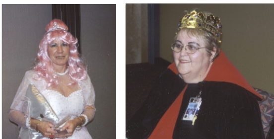
Last year, there were tooth fairies and people from fairy tales roaming through the office on October 31.