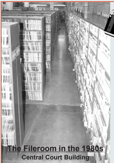
The Fileroom in the 1980s Central Court Building

The Public Affairs Office has found a few photos of the Clerk's Office from the 1980's. In future issues of the newsletter, a few of those photos will be shown along with a comparison photo from today. Below are comparison photos of the Fileroom.