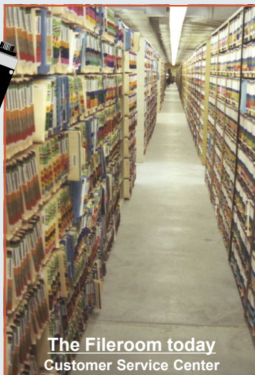
The Fileroom today Customer Service Center