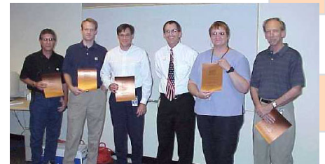
The ITG Application Development Team were among the many Casey award winners at the CSC event.