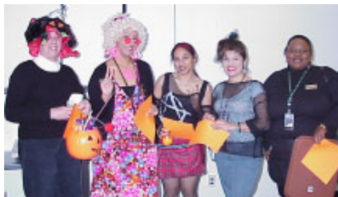
The winning crew members at the Downtown event pose for a photo.