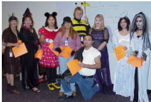
The cast of characters at the Customer Service Center.