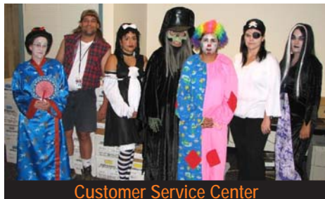
Customer Service Center