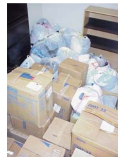
Some of the boxes and bags of items CSC staff donated to help those in need.

But Spring is here now, and the staff took the opportunity to spring into another charity drive. This one was called "Operation Spring Cleaning," and it resulted in a