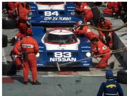
Office recordsetters know how to get the job done fast

"I would like to say thank you to all of the Fileroom staff for their continued hardwork."