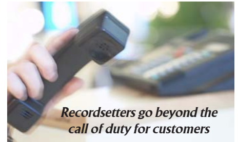
Recordsetters go beyond the call of duty for customers