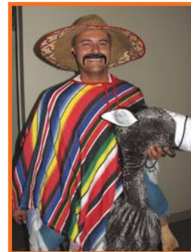
BEST HISTORICAL "Don Quixote" Dar Unger