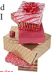
Giving the gift of quality service