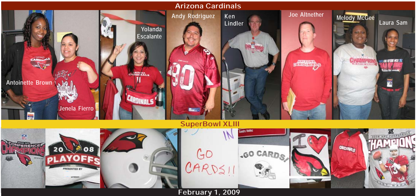
February 1, 2009