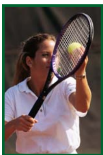
Serving customers very well!