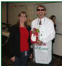
Best Dessert Winner