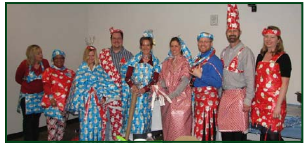
Fashion Show Models