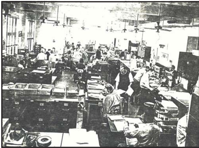
Pictured above is a scanned image of a photocopied picture of the Clerk of the Court's Office on the 2nd Floor of the Old Courthouse prior to 1965.

His military career led him to be at Pearl Harbor on December 7, 1941. Immediately after the first wave of Japanese planes had attacked, his B-17 bomber was shot down but he was able to parachute out. He earned a Purple Heart medal.