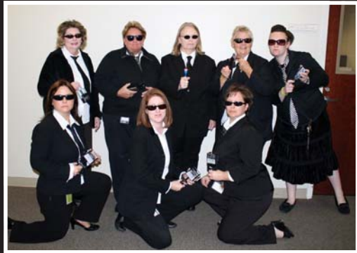
"C.I.B. - Court In Black"