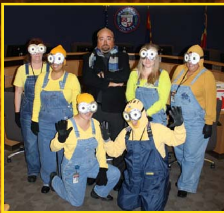
BEST LARGE GROUP "Despicable Me"

The results are in from the 6th Annual Office Costume eVent . There were 349 votes cast by Clerk of the Court employees. The eVent began on Oct. 31 when employees, who dressed in Halloween costumes, were photographed. Seven costume categories were then created from the photos and a survey was made that allowed employees to see the costumes and vote for their favorite ones. Below are the costumes that were voted the best in each category by employees: