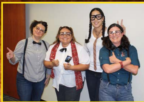
BEST SMALL GROUP "The Nerds"