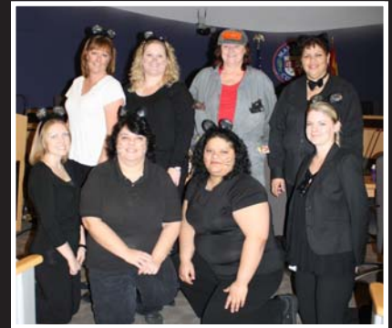
"Exterminator and Mice"