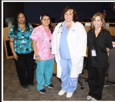
"Dockter Sue Poena and the EcR Nurses"