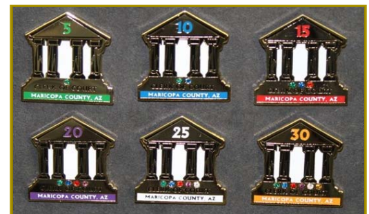
The Clerk of the Court new service pins are in! Pictured above, top row, left to right are the new 5, 10, and 15-year pins, (lower row) and the 20, 25, and 30-year pins.

1) Your name; 2) Year of pin(s) requested (the pins are 5, 10, 15, 20, 25, 30); 3) Year you started with Office (for verification); 4) Your interoffice mail code. The older pin supply is limited, and so the pin requests will be handled in a first-come, first-serve basis.