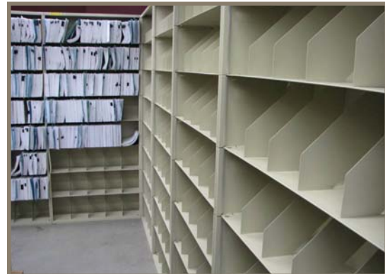
Some of the shelving units at the Customer Service Center are going paperless thanks to the eAppeals pilot program.