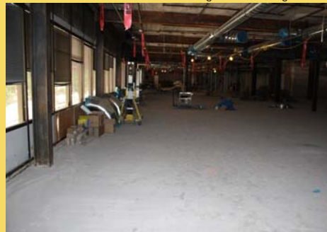
A view of the remodeling area looking west.