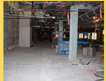
A view of the former Jury Room & court offices.