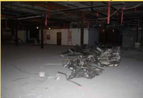
A view standing in former Family Support Services area.