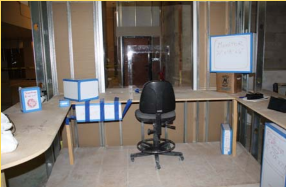
A back view of the mock-up of the new filing counter window.