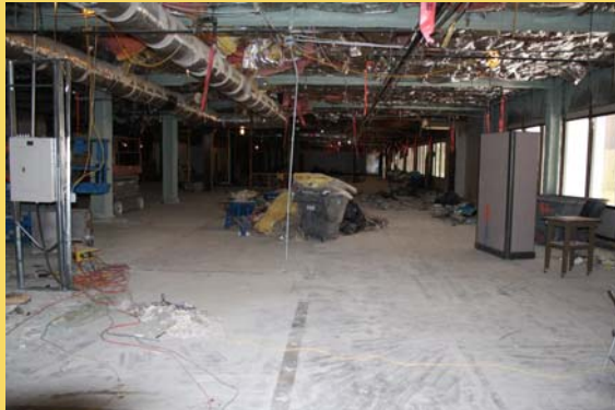
A view of the remodeling area looking east.