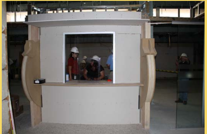
A front view of the mock-up of the new filing counter window.