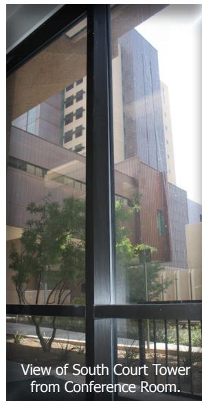
View of South Court Tower from Conference Room.