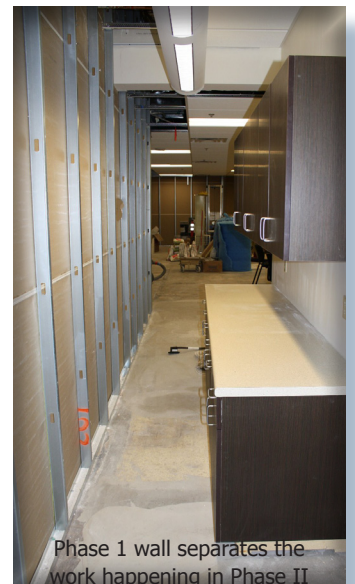
Phase 1 wall separates the work happening in Phase II