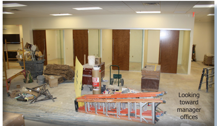
Looking toward manager offices