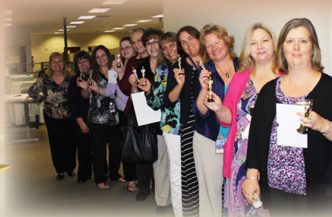
The Northeast Courtroom Clerks