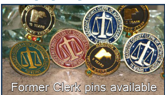
Former Clerk pins available