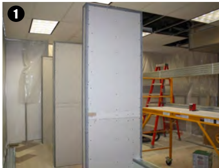
Photo 1 - Framing of the new service windows. Photo 2 - Krizna Rodriguez sits at a temporary desk set-up to assist customers. Photo 3 - Looking at the curtained-off construction project from the outside office area.

The remodeling of the Northwest Office Filing Counter began on May 21. The project is being done in two phases and is expected to be completed this month. Among the improvements, the project includes expanding the service windows from five to seven, installing a Qmatic System and new seating in the lobby for customers, and remodeling the break room and vault area.