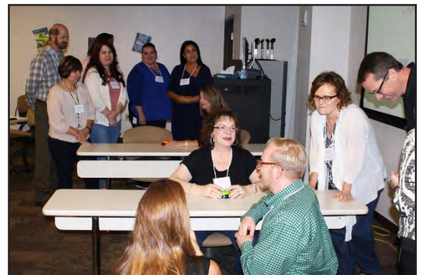
Talking about my generation - The retreat included some friendly competition among the Office leadership on generational knowledge.