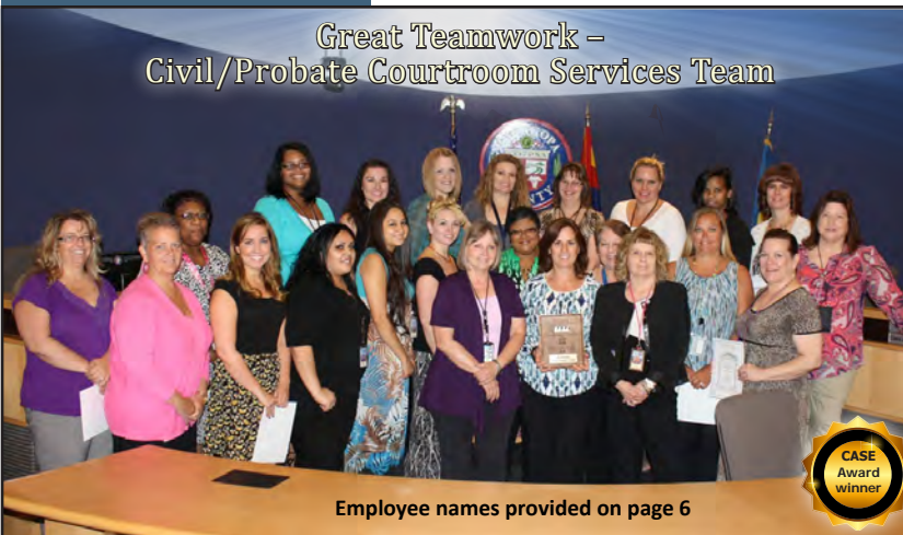
Employee names provided on page 6