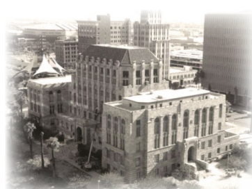
The Old Courthouse opened in 1929

The 90th Anniversary of the opening of the Old Courthouse was commemorated this month by the Superior Court and Maricopa County Justice Museum and Learning Center. The event took place on June 14. It included a band performance and actors dressed in 1920s attire. See page 8 for photos from the event and comments from Clerk employees who have worked or currently work in the historic building.