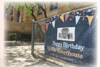
Photos from the OCH's 90th Commemoration Event