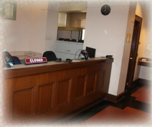
The Probate File Counter in the OCH just prior to moving out of the building.

Last summer, the Clerk's Office moved the Probate File Counter out of the Old Courthouse marking the first time in decades, and perhaps since the building's existence, that the Office did not have a departmental presence in the historic facility. Today, there are some courtroom clerks who remain working in the building, but the days of the Clerk's Office having an actual office/department presence are gone. This month, the 90th anniversary of the building was commemorated at a special event. To mark this historic occasion, following are some comments from Clerk employees who worked in the building at one point or work there now.