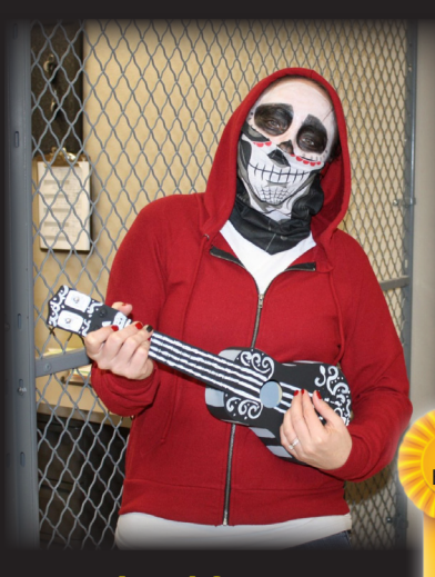
Miguel from Coco Savanna Sharp