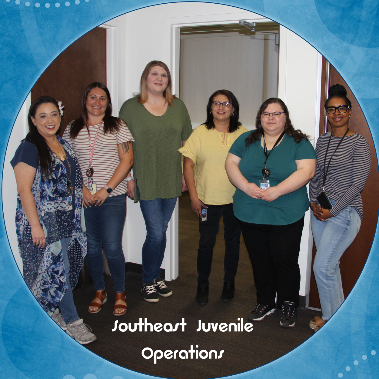
southeast Juvenile Operations

Thank you for your service and the special life you bring to the Office!